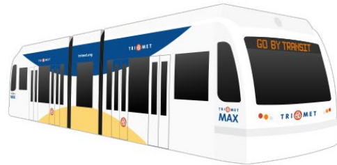
MAX Light Rail