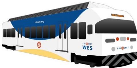
WES Commuter Rail