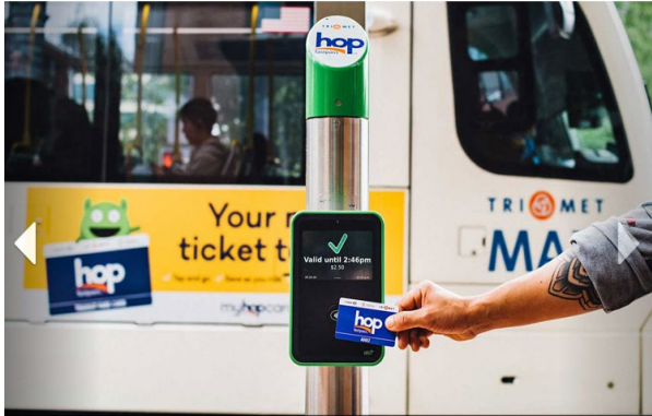
Outreach Begins for 2024 Proposed Fare Increase